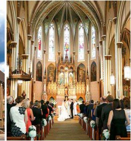
Immaculate Conception Church

1431 N. North Park Avenue, Chicago, IL 60610